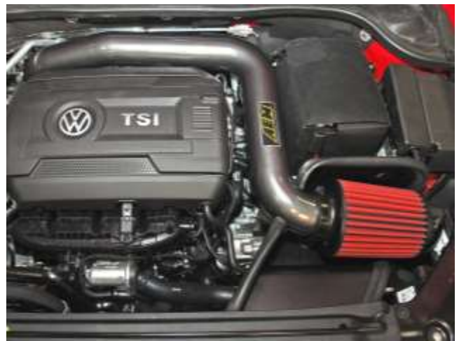
g. Finished installation of AEM Intake System.