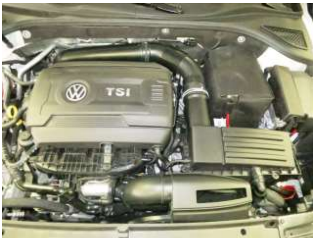
f. Factory air induction system.

e. Route the retained hose from the airbox to the end of the filter and rotate the fitting in the end of the hose to align it with the end of the filter. Install the adapter into the end of the filter and rotate the filter for best alignment before inserting the hose into the fitting until it clicks to indicate engagement on both sides. Torque all three hose clamps to 30 in-lbs.