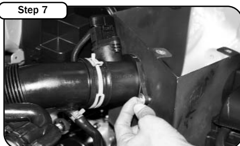
Step 7 Lower the housing assembly in the engine compartment. Secure the MAF sensor to the housing with the supplied hardware.