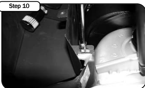
Step 10 Secure the housing to the engine compartment with the supplied hardware.