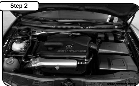
Step 2 Complete stock intake.