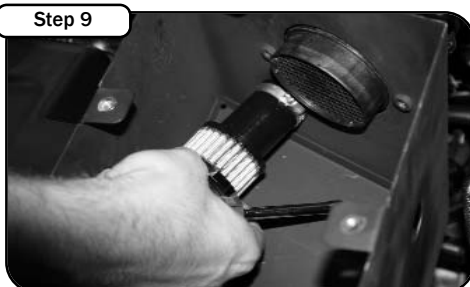
Step 9 Slide the intake breather air filter over the smog pump elbow. Secure with the provided clamp.