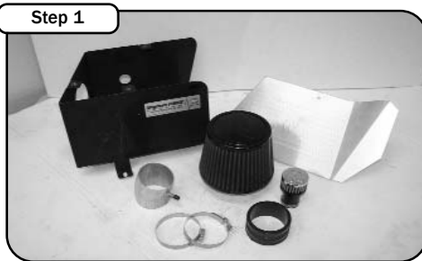
Step 1 Complete kit verify all components are present prior to beginning installation.