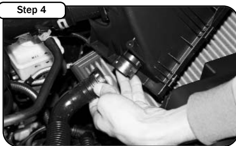
Step 4 Disconnect the smog pump from the air box lid.