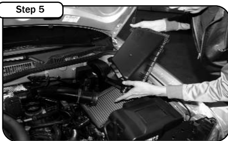
Step 5 Remove the factory air box lid and air filter.