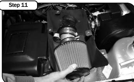
Step 11 Install the intake tube, couplers and air filter. Do not use any grease or oil.