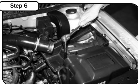
Step 6 Remove the two 10mm bolts securing the lower portion of the air box. Remove the air box.