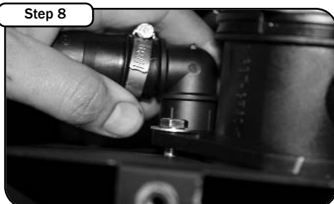
Step 8 Connect the elbow to the smog pump inlet hose. Secure with the supplied mini clamp. Slide the elbow thru the opening on the side of the housing.