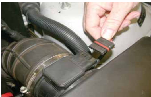
2. Release the locking tab and disconnect the mass air sensor electrical connection.

1. Turn off the ignition and disconnect the negative battery cable. NOTE: Disconnecting the negative battery cable erases pre-programmed electronic memories. Write down all memory settings before disconnecting the negative battery cable. Some radios will require an anti-theft code to be entered after the battery is reconnected. The anti-theft code is typically supplied with your owner's manual. In the event your vehicles' anti-theft code cannot be recovered, contact an authorized dealership to obtain your vehicles anti-theft code.