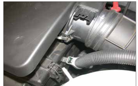
5. Unhook the wiring harness retainer shown from the rear of the box.