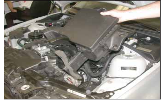
6. Lift the air box from the rear and remove it from the vehicle. NOTE: Pull the air box backwards to dislodge the upper and lower fresh air intake.