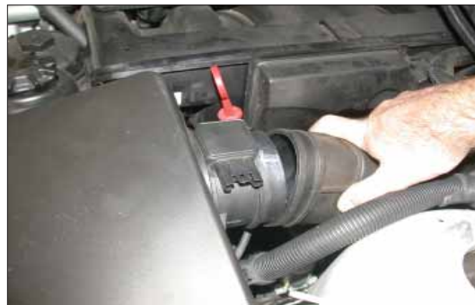
4. Loosen then hose clamp which secures the factory intake tube to the mass air sensor, then disconnect the intake hose from the mass air sensor as shown.