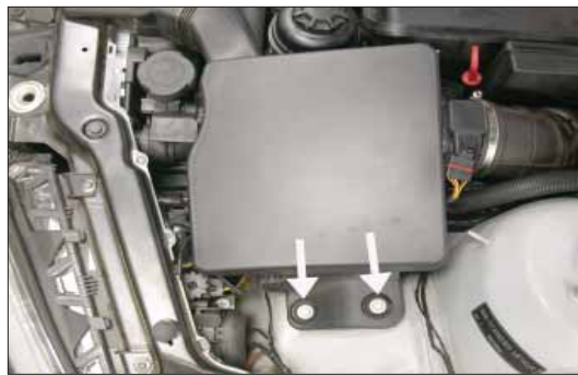
3. Remove the two factory air box mounting bolts shown.