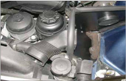
27. Install the factory fresh air tube into the heat shield as shown.