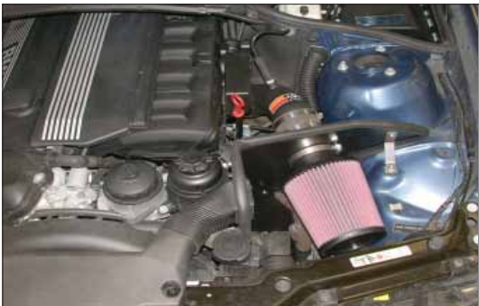
32. Reconnect the vehicle's negative battery cable. Double check to make sure everything is tight and properly positioned before starting the vehicle.