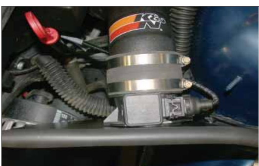
30. Reconnect the mass air sensor electrical connection.