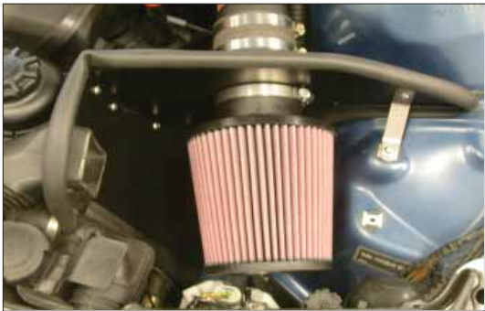
31. Install the air filter and secure with the hose clamp provided.