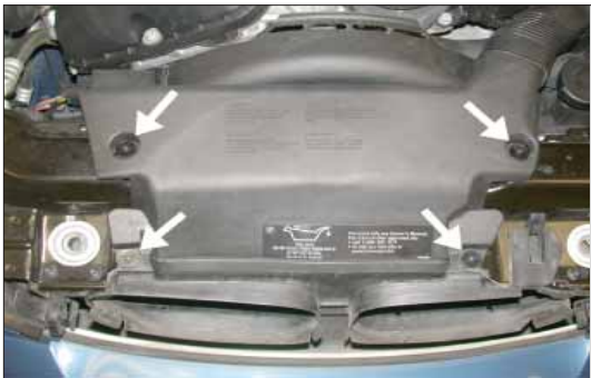
28. Reinstall the fresh air duct removed in step #4 and secure with the four factory retaining pins.