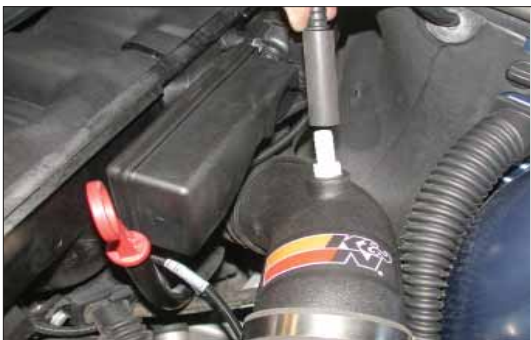
29. Using the supplied silicone hose, attach the factory vent hose to the npt fitting on the intake tube.