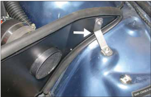
26. Install the provided bracket onto the heat shield and inner fender with the provided hardware shown. NOTE: The long portion of the bracket should attach to the heat shield.