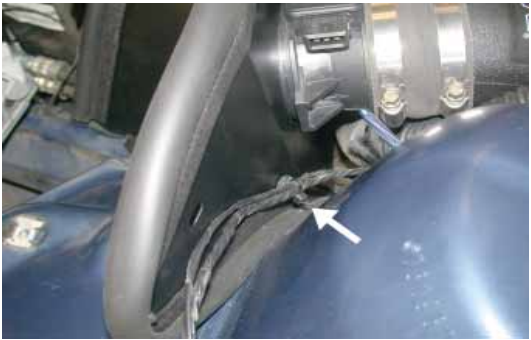
25. Secure the wiring harness clip removed in step #21 to the heat shield as shown.