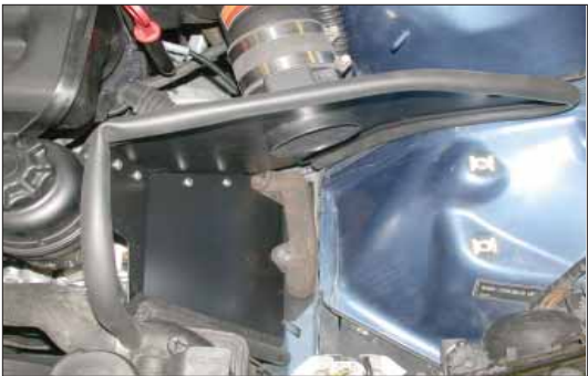
24. Reinstall the lower rubber air box locator removed in step #11 and re-secure the heater hose.