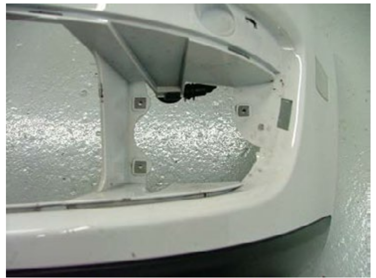
Speed clip inserts installed.