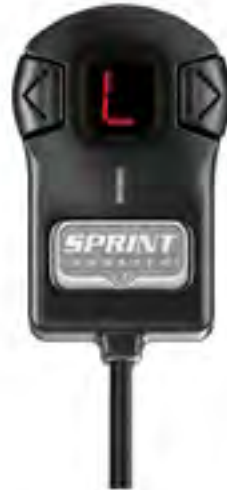
PEDAL LOCK MODE