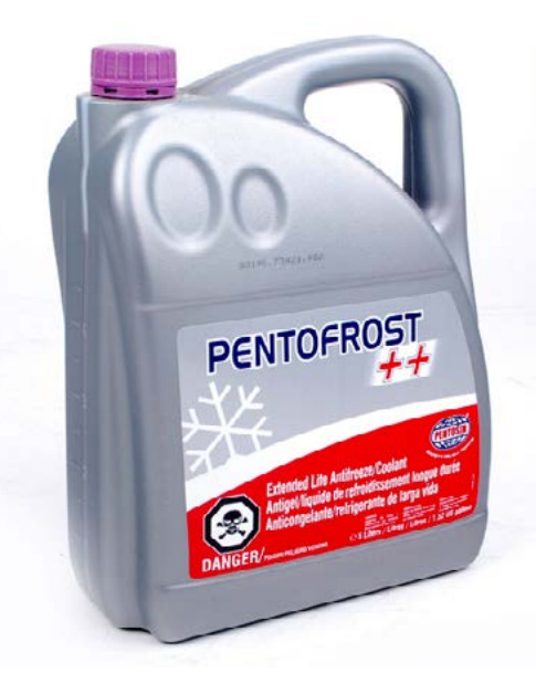
An extended life antifreeze like Pentosin G12++ protects against freeze and boilover, and provides lasting chemical protection for years and many thousands of miles.

More recently, OEMs, including VW/Audi, have made adjustments to improve protection. Hybrid Organic Acid Technology (HOAT) antifreeze like G12++ even adds a small dose of silicate. A faster acting anti-corrosive, silicate in small amounts protects more quickly than OAT alone, and can "heal" minor metal damage faster. OAT additives then continue to protect the system over the long haul. It's important to realize that it can take several thousand miles of driving before OAT protection kicks in.